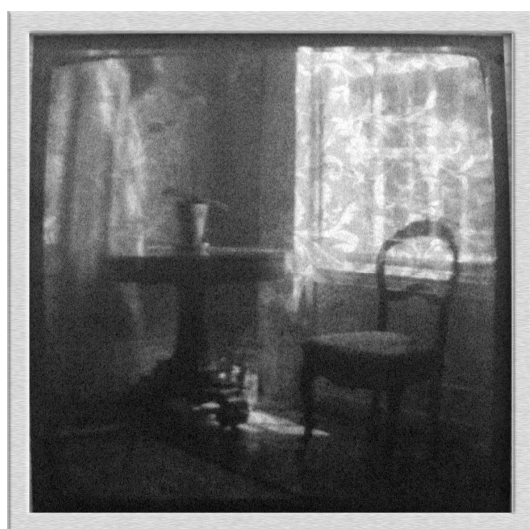
Monochrome 1st Place: "A Touch of the Past" by Max Tiller