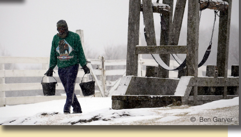
Find out more about HSV at: hancockshakervillage.org.