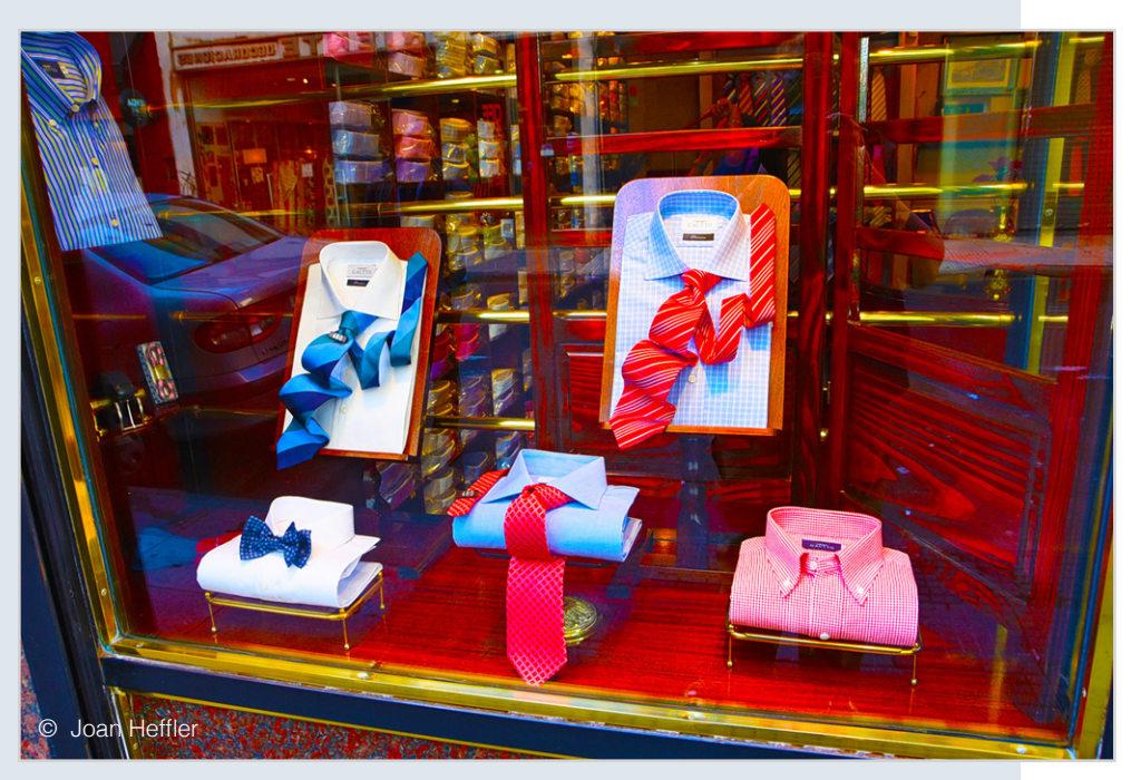
See more of Joan Heffler's "Pictures with Personality" at www.joanhefflerphotography.com