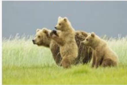
Bear Family Rich Phalin Unlimited Vision Photo Club