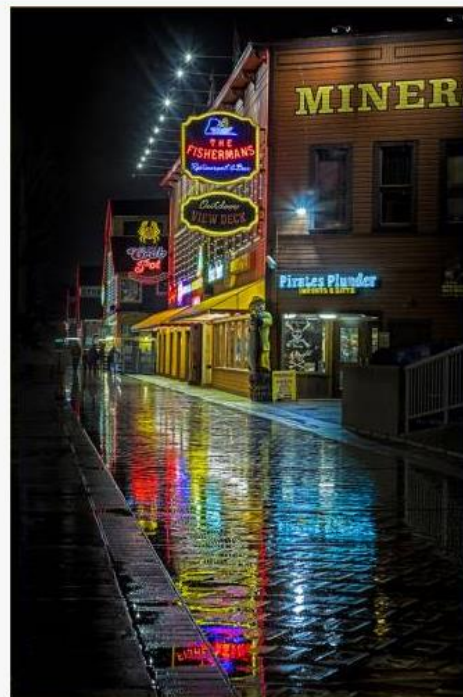
Grp B, 2nd Place, Seattle Waterfront Night, Sonya Lang, Pilchuck Camera Club