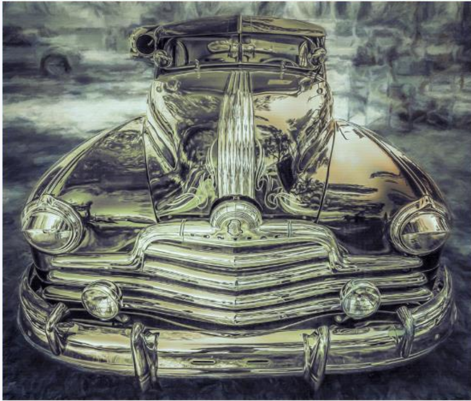
Gr A - HM, Pontiac Style 2703, Pam Vick, Lancaster Photography Association