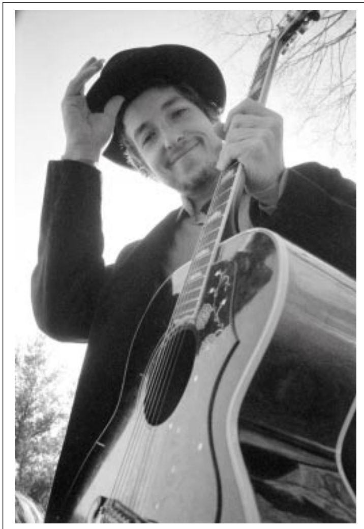
Bob Dylan.