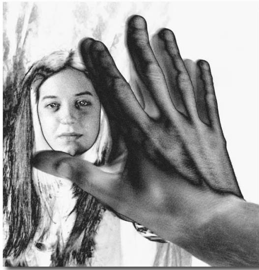
That which is desired is always unattainable.

A maximum of two prints may be entered on Critique Night. Submit your best and wear your thickest skin!