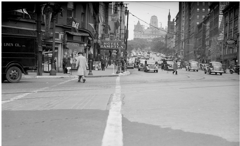
State Street Hill circa 1934