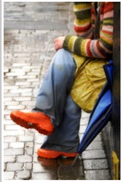
Above: Orange Boots ...and Gum 1st place color