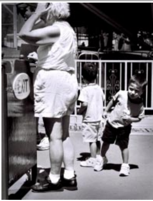
Left: Hey Kid Watcha Looking At, 1st place monochrome