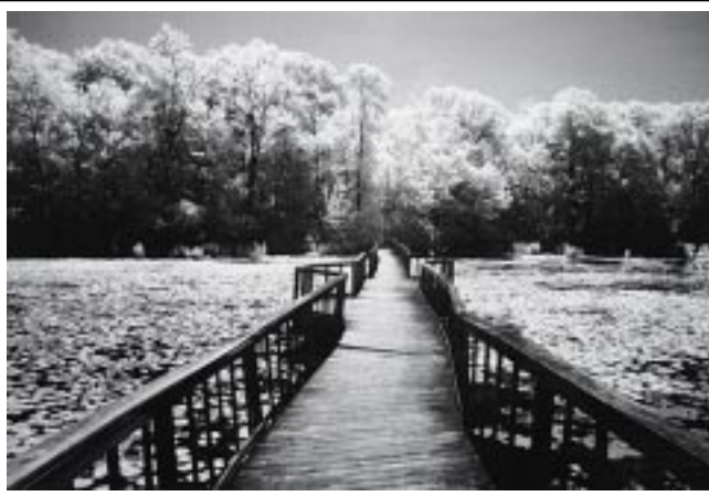
Infrared photo © Max Tiller