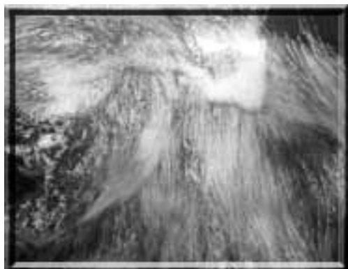
Assigned 1st place: Test 3 by: Pat McCormick