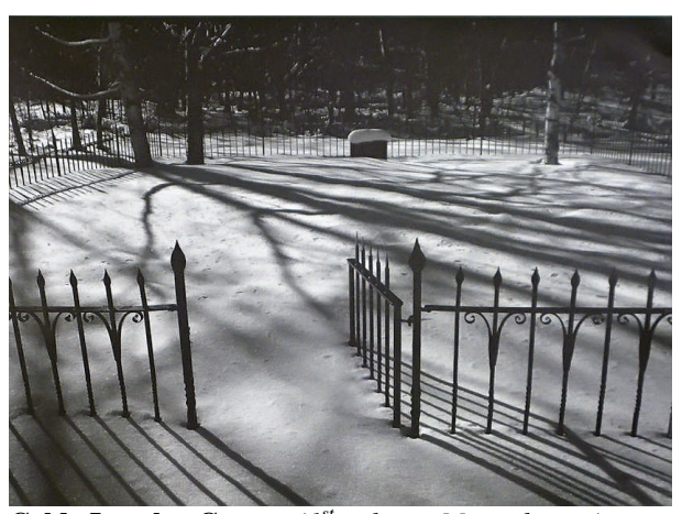
Cold Lonely Grave (1<sup>st</sup> place Monochrome) was photographed by Ray Henrikson at a mountaintop XC Ski Area in Vermont with a Nikon D70s and Sigma 18-250 lens; ISO: 400. Edited in Picassa and printed on Epson 2880.

Max Tiller photographed the sanctuary of St. Mark's Church ( 1 <sup>st</sup> place Color) in downtown Albany using a Sony A200 DSLR and Sony 18-70 mm lens with tripod and remote cable release at St. Mary's church. F/16 @ 8 sec. ISO: 400. Processed in Topaz & Picture Publisher 10; printed on Staples double-sided matte paper with Epson 2400 Printer.