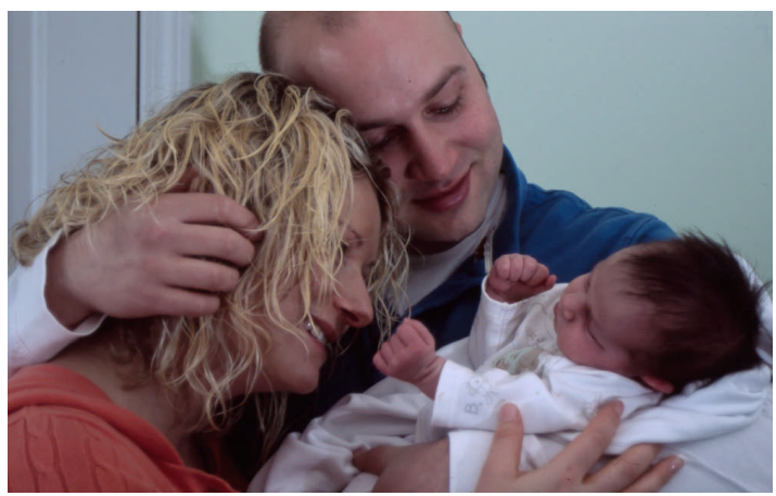
April Slide Winners [continued from page 7]

Liberty (3<sup>rd</sup> place General Slide) by Ken Deitcher . Ken shot this image of water droplets (augmented by a small amount of glycerine) on a rose stem with a spotlight behind the rose thorn, on Fujichrome Velvia film, using a tripod-mounted Canon A2E camera and 100 mm macro lens. f/16 @ 2 sec. ISO: 100