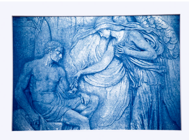
Fine Art Print Winners

This untitled cyanotype (1<sup>st</sup> place Alternative Process Print) is by Ronald Ginsburg . Photo taken with 35mm TMax 400 of a monument at Albany Rural Cemetery and scanned. A digital negative for contact printing was made following Dan Burkholder's step by step guide to affordable enlarged negatives for platinum, silver and other printing processes ("Making Digital Negatives for Contact Printing"). Pictorico Premium OHP Transparency Film was used for making the digital negative. A cyanotype print was then made by exposing the digital negative in contact with art paper sensitized with iron salts and exposed to ultraviolet light.