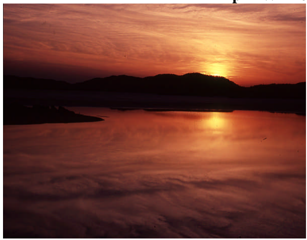
Adirondack Lake at Sunset (1<sup>st</sup> place Assigned slide, above) and Golden Ice - Great Sacandaga Lake (2<sup>nd</sup> place Assigned slide, below) are both by Jeff Plant .