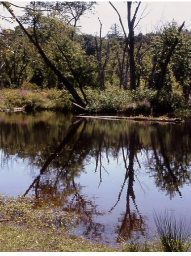
Pond (Beldon) II (3<sup>rd</sup> place Assigned Slide) by Maureen Goldman .