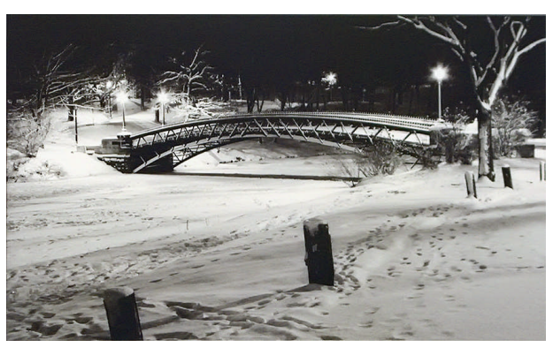
Washington Park at Night Time (3<sup>rd</sup> place Assigned) was photographed by Barb Lawton around 10 pm with a Canon 50D, Canon 18-200 IS lens, tripod and remote cable release; f5.6 @ ½ sec. ISO: 1250. Converted from RGB to grayscale in Photoshop CS4.