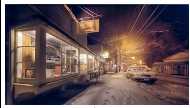
The Golden Notebook (2<sup>nd</sup> place Assigned) is a tripod-stabilized HDR image from 3 exposures, each 2 stops apart, photographed by David Jeffery during a winter storm just before midnight with a Canon 5DMk2 and Sigma 12-24 @12mm lens @ f/8; ISO 400. Processed in Photomatix and Photoshop.